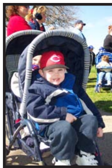
He's allowed to roll, instead of walk, he didn't get sponsors!

It was a wonderful day where teachers, students, parents, grandparents and friends came together for a common cause.