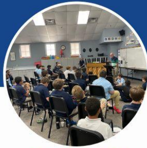
COLLEGE PREP CLASSES