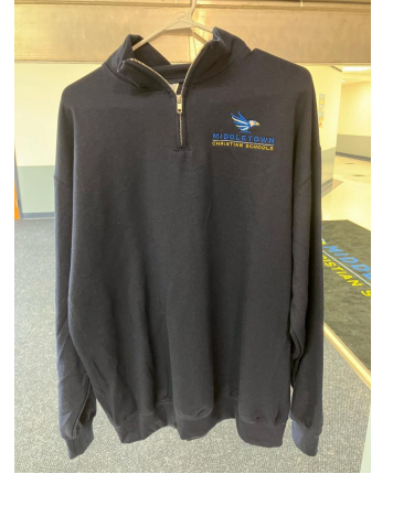
Navy Blue Quarter Zip with Vertical Signature Logo

Listed above are all of the new school store items that are approved outerwear! Approved Outerwear is now listed on our school website as well. To visit the page click <u>HERE</u>