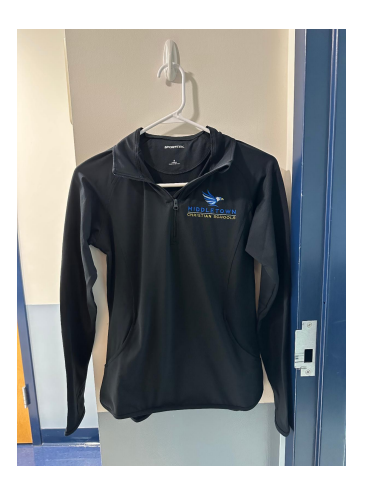
Black Quarter Zip with Vertical Signature Logo