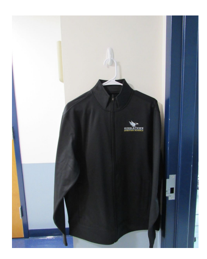
Black Full Zip with Signature Vertical Logo