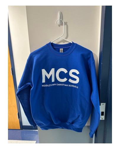
Royal Blue Crewneck with MCS Monogram