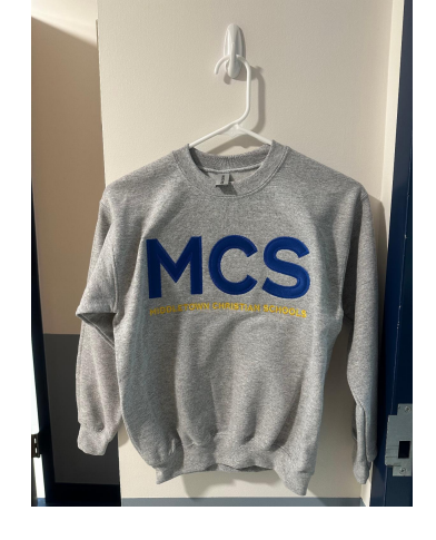
Grey Crewneck with Embroidered MCS Monogram