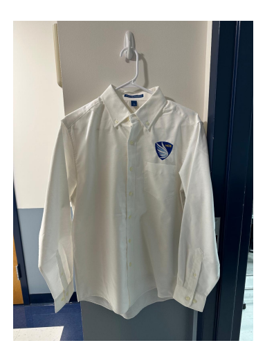
White Oxford Button Up with MCS Shield