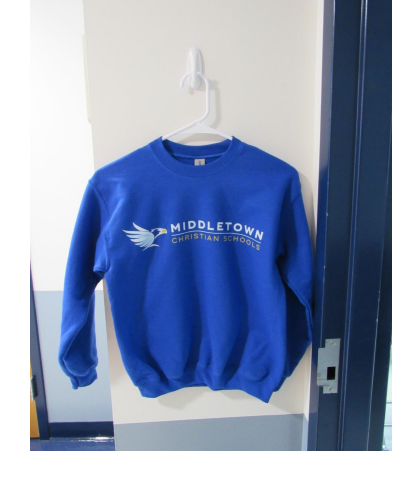
Royal Blue Crewneck with Signature Horizontal Logo