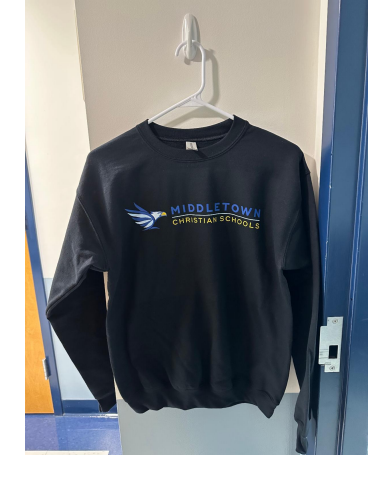
Black Crewneck with Signature Horizontal Logo