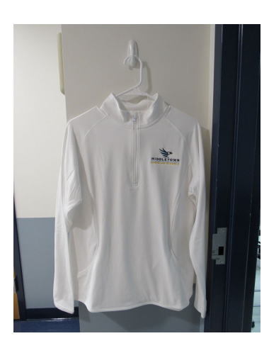
White Quarter Zip with Vertical Signature Logo