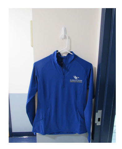
Blue Quarter Zip with Vertical Signature Logo