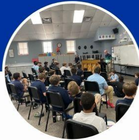
COLLEGE PREP CLASSES