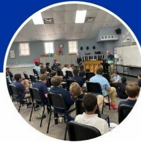
COLLEGE PREP CLASSES