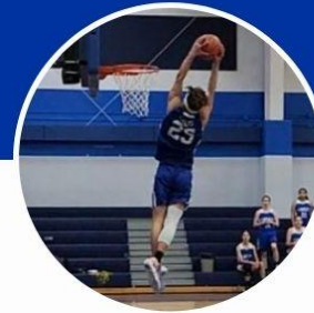
EXTRA- CURRICULAR ACTIVITIES

Accepting applications for the 2024-2025 school year!