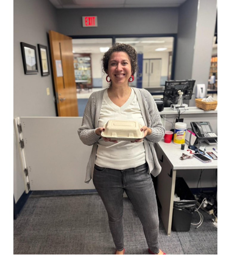
Thank you to Grace Baptist Church for sponsoring a Taco Truck for lunch on Monday!