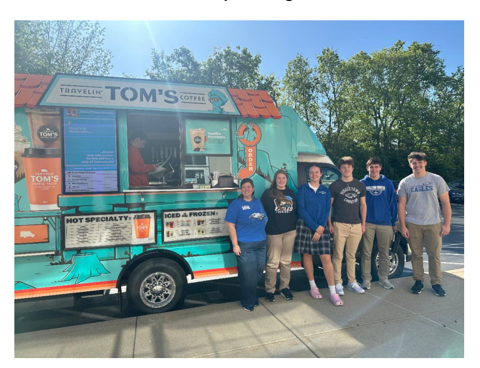
Thank you to Berachah Church for sponsoring a Coffee Truck on Friday!