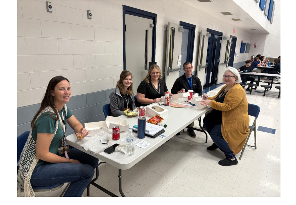
Thank you to LIFEHOUSE Church for sponsoring Simple Roots boxed lunches on Wednesday!